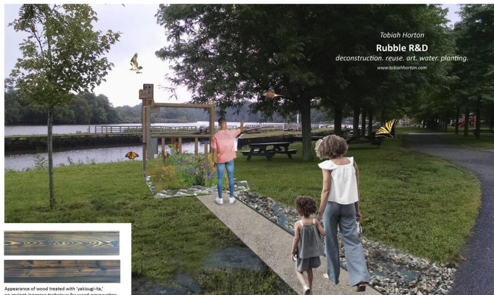
Raritan Frame Sculpture and Citizen Science Device

We will also install our first Watershed Sculpture Project "frame" in New Brunswick's Boyd Park. This is a collaborative project with coLAB Arts and Rutgers Cooperative Extension Water Resources and is also supported through a grant award from the Middlesex County Cultural and Arts Trust Fund Program funded by Middlesex County, a partner of the New Jersey State Council on the Arts.